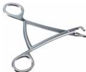
Reduction Forceps with Serrated Jaw