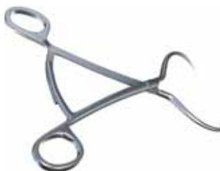
Reduction Forceps with Ratchet